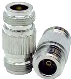
N Female barrel connector included